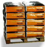
Polyethylene valve bags of 25 kg (55 lb) net weight on 500 kg (1100 lb) pallets